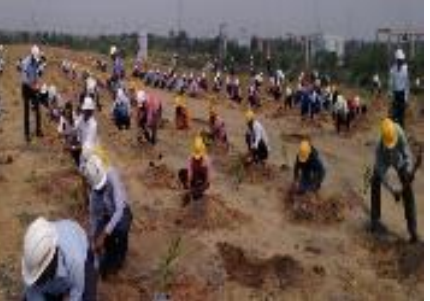
Sapling Distribution – Till date we have distributed/planted 12875 Saplings (Forest & Fruit) in the community.