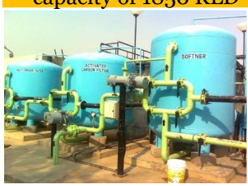
Wastewater is being treated in STP at site & reused for flushing use. Sludge from STP is being used as manure. RGIA is a zero liquid discharge facility